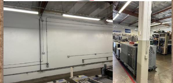
Our walls in the Unit A Lab post-painting.